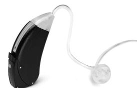
117/45 Latitude 4 Moda II

Latitude™ 4 Moda™ II is suitable for fitting mild to moderately severe hearing losses and can fit audiogram configurations ranging from reverse to precipitously sloping.