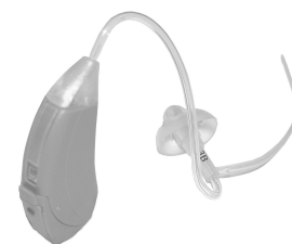
118/45 Next Essential Moda II

Next Essential Moda II is suitable for fitting mild to moderately severe hearing losses and can fit audiogram configurations ranging from reverse to precipitously sloping.